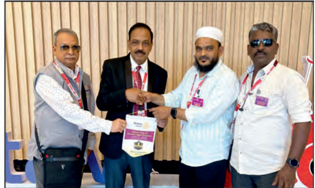
RC Virudhunagar Kingdom, RID 3212