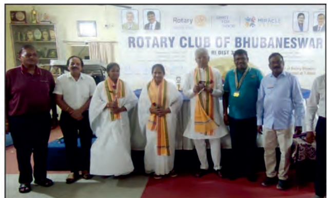
Raksha Bandhan Celebration with the sisters from Prajapita Brahma Kumaris