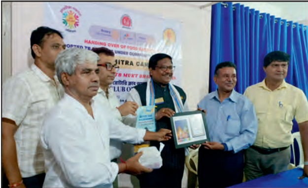
RC Aspire, Agartala