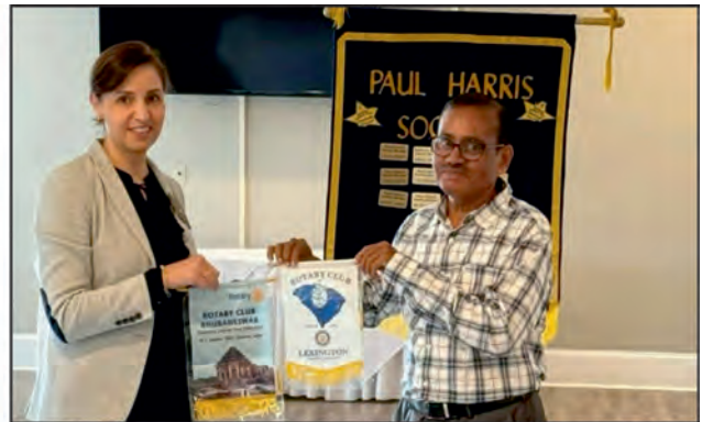
Rotary club of Lexington