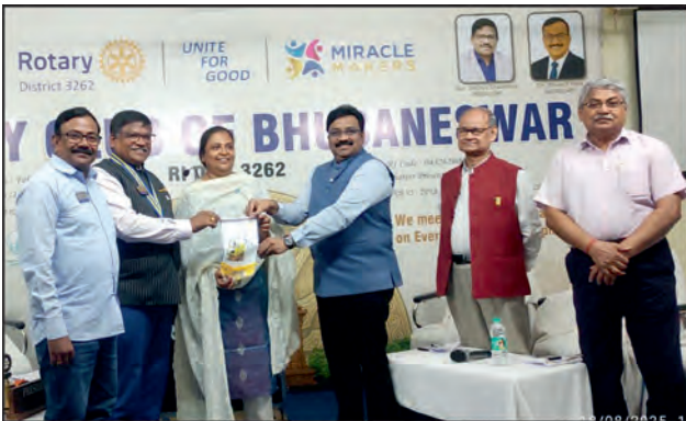
Rotary Club of Makati Legazpi