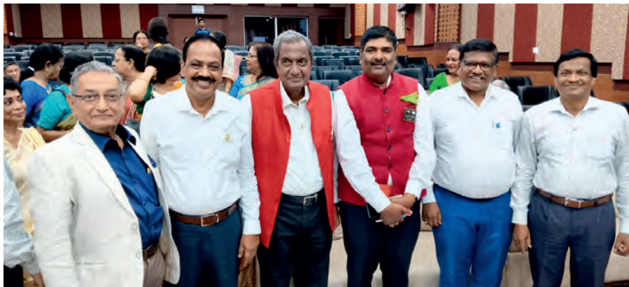
Members attended the Seminar on ORGAN DONATION organised by Rotary Club of Bhubaneswar Metro at Institute of Life Science, Bhubaneswar on 13th August, 2025 at 6.00pm.